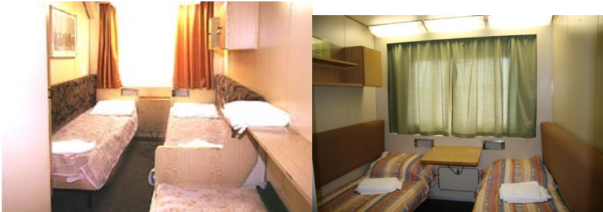
SNGL Twin (middle deck)